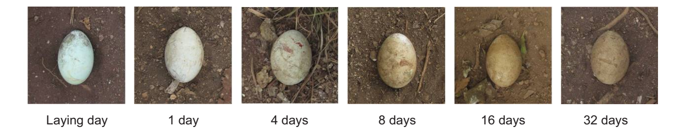
Figure 2: Blue-footed booby eggs at different ages.

.514) nor time of day ( \chi_1^2 = 1.415 , P = .234) affected the probability of destruction. Males carried out 82% of booby attacks, and 70% of these were courting or solitary males with a territory but no clutch.